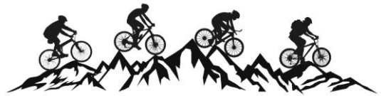
Four Mikes on Bikes 2019