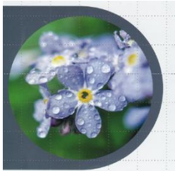
Chalfont Dementia Support